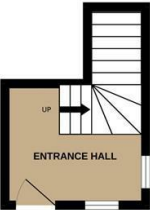
GROUND FLOOR 87 sq ft (8.1 sq.m.) approx.